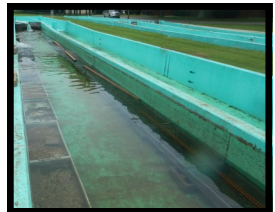
Mussels reared at Minor Clark Hatchery, Morehead, KY

In the past few years the Center has successfully reared several rare and endangered mussels using in vivo and in vitro (artificial culture methods) including the Cumberland bean, purple catspaw, fanshell, salamander mussel, snuffbox, slippershell, fatmucket, and dozens of others to a stockable size.