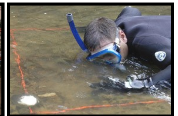
Juvenile culture systems used to rear juvenile mussels (left). Mussel sampling in the Green River.