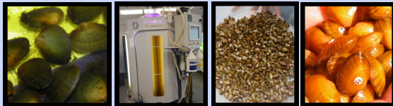
Juvenile mussels of the endangered Cumberland bean (left), pink mucket (right), slippershell mussels (right center) reared at the Center. CMC Bioreactor for algae culture (left center).

The Center was founded in 2002 by the Kentucky Dept. of Fish and Wildlife Resources. Its mission is to restore and recover rare and imperiled freshwater mollusks. Our staff have years of experience in many fields related to fish culture, aquaculture, malacology, shellfish and bivalve culture, algae culture, aquatic ecology, limnology, freshwater ecology, conservation biology, fish and shellfish husbandry, endangered species conservation, population ecology, ichthyology, and many other areas. We have worked with over 70 species of freshwater mussels, 75 species of fishes, 12 species of snails, and dozens of algae species. Our primary focus is the conservation, restoration, culture and propagation of freshwater mussels.